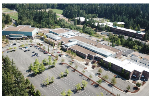
In 2019 with 'D' Wing, Annex and 17 portables

Those values and commitments continue today, but the way students learn has definitely taken a whole new look.